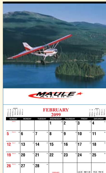
A7 (shown full bleed) size 11" x 17"

NEW! DOUBLE LOOP BINDING +15¢(G) per calendar