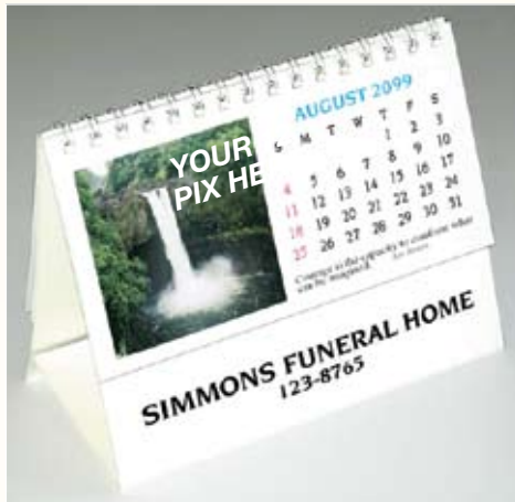
EC410 size 4" x 5 1/2"

Includes: 12 Custom Pictures • Wire-O Binding • 1 Line of Type with each picture