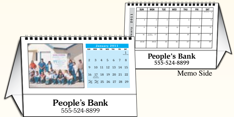
EC411 size 8 1/2" x 6"